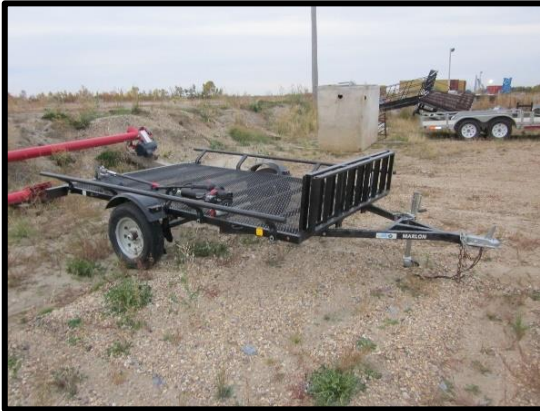
2019 utility trailer