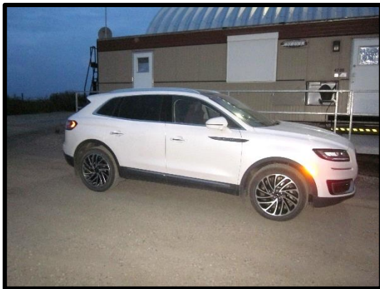
2019 Lincoln Nautilus Reserve