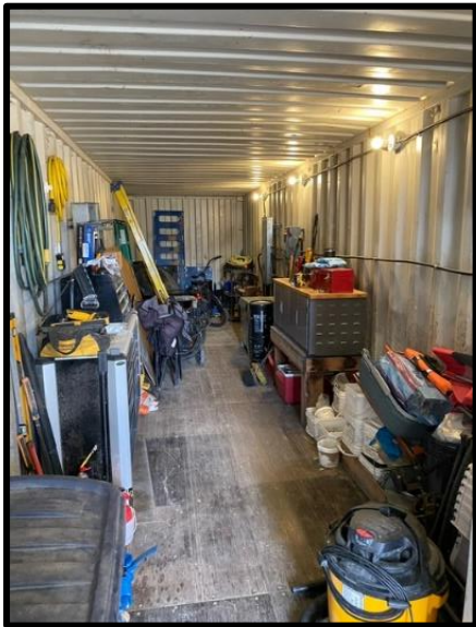
40 foot Sea-can with electrical equipment and LED lighting