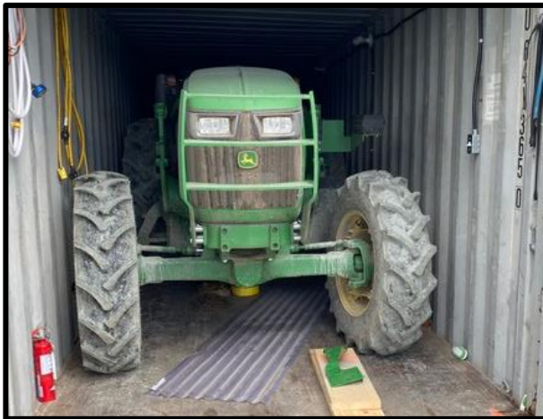
2018 John Deere 5100ELV FWA 1,100 hrs