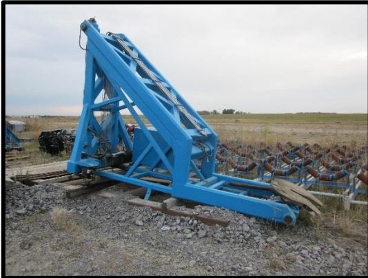
Two tipper truck attachments