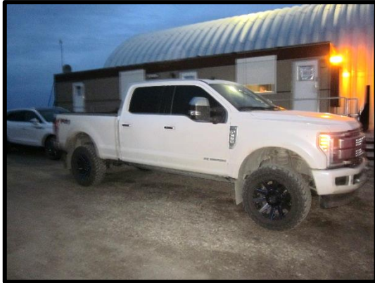
2019 Ford F350 Super Duty Platinum 6.7L Power Stroke, aftermarket wheels and tires

The following equipment was inspected. All of the equipment is fairly new and would have a remaining economic life of between 10 and 25 years.