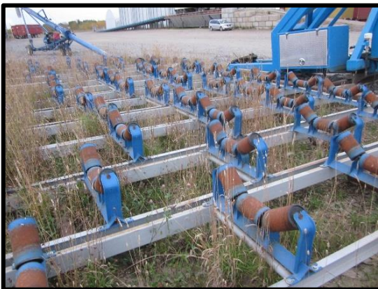
12 individual conveyor roller sections