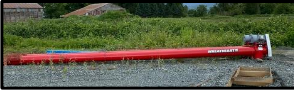
2018 Wheatheart augers (UB 13-21) Four, 13" x 33 Ft