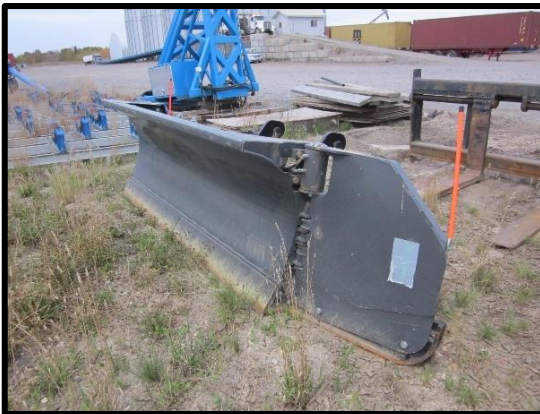
2020 Ami Reactor snow blade