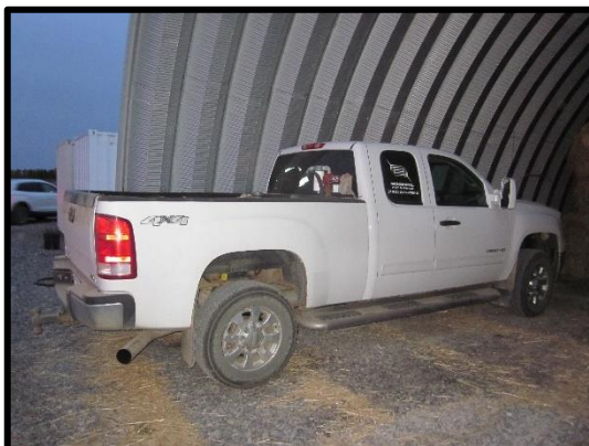
2013 GMC Sierra 2500HD