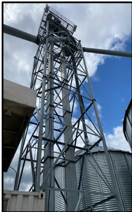
2015-2019 Grain Handling Equipment 80 ft, 12,000 bus/hr grain leg Four auger extensions Modular grain pit with cover, 40 MT Grain distributor