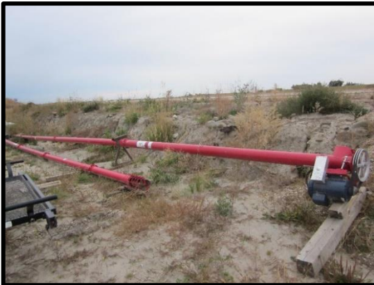
Miscellaneous tools and equipment

Augers, down spouts, grain leg parts, motors, steel decks and walkways