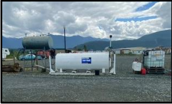
2015, 5,000 litre fuel tank on steel skids